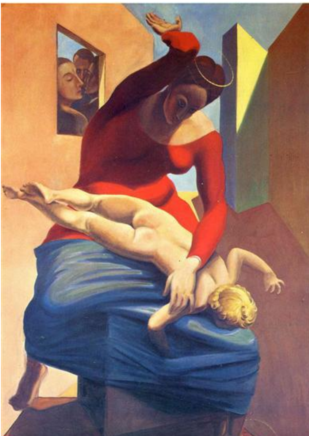
The Virgin Spanking the Christ Child before Three Witnesses: Andre Breton, Paul Eluard, and the Painter by Max Ernst (1926)